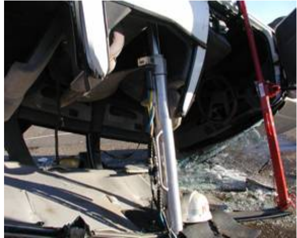
Vehicle lying on the side