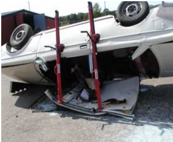
Vehicle lying on the roof